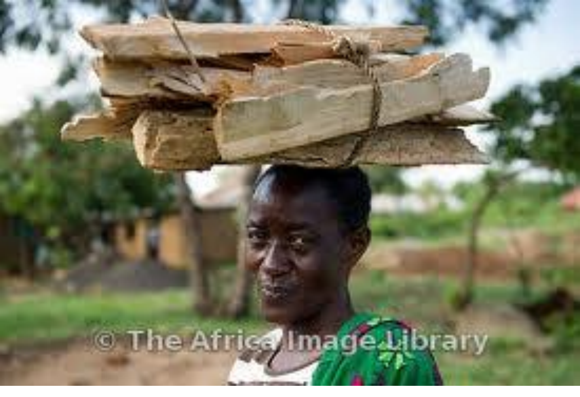
Diminishing wood fuel